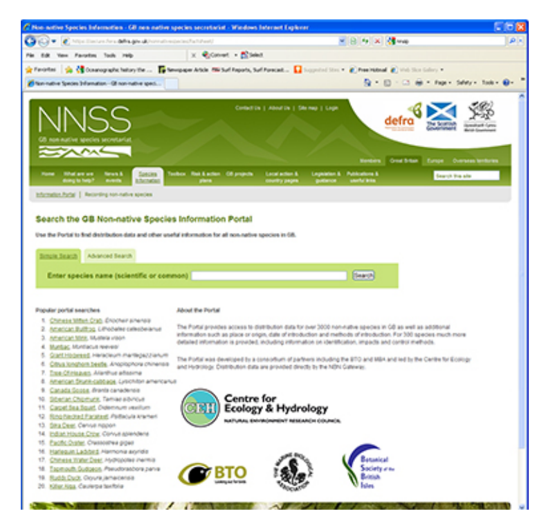
Figure 2. The web page of the GB Non-native Species Information Portal at: https://secure.fera.defra.gov.uk/nonnativespecies/factsheet/