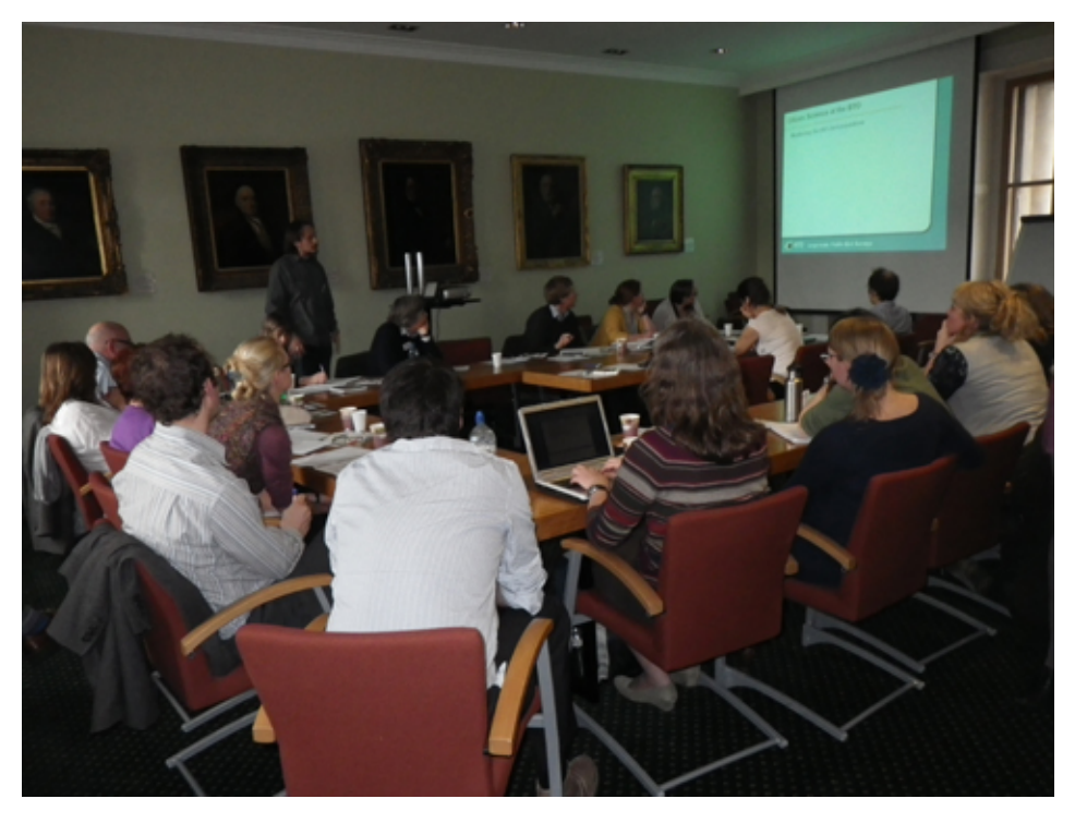
Figure 3. Participants at the workshop at the Linnean Society, London.

Communication and integration amongst marine recording schemes needs to be fostered by leadership from key organizations. For example, the MBA and Biological Records Centre can speak for the community and pull all the elements (data, science and policy needs, publicity etc.) together. This should not be a "top-down" approach; rather the aim should be to ensure that the volunteer recording community is getting what it wants.